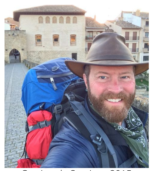
Camino de Santiago 2015