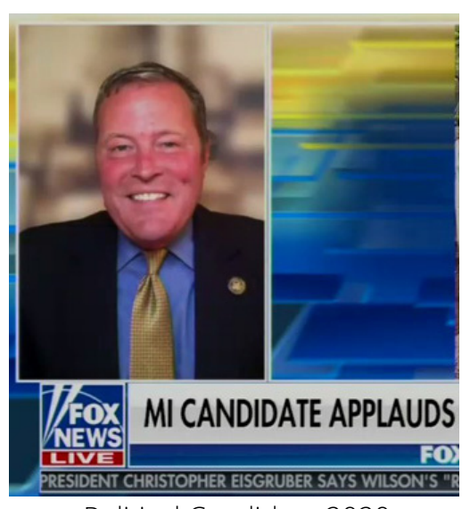
Political Candidate 2020

How to make the tough decisions. Deciding when to change directions. The most important decision to make.